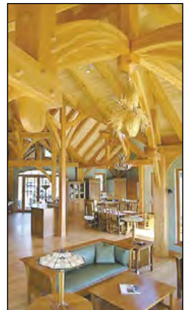
Wood beams soar above the rooms.

"They did such a great job I wanted people to be recognized," she said.